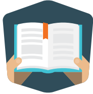
LIQUOR LIABILITY LAWS AND PENALTIES