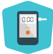
CALCULATING BLOOD ALCOHOL CONTENT