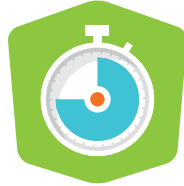
TIPS ON PROVIDING GOOD CUSTOMER SERVICE